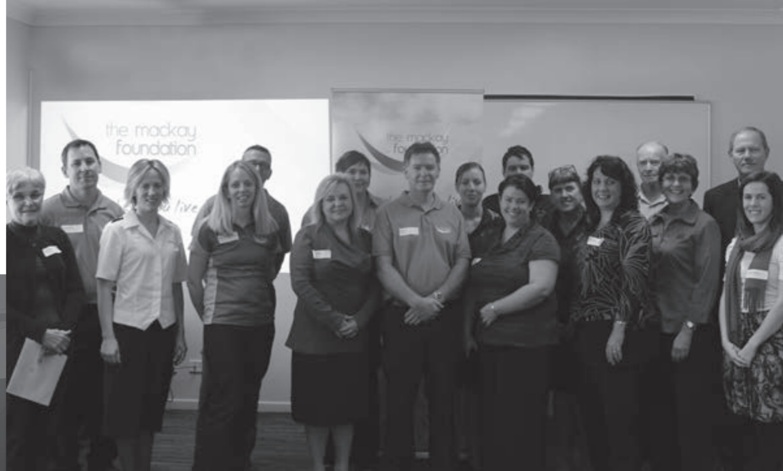
The Mackay Foundation Directors with the 2012 Grant Recipients.

It has been an exciting year for The Foundation, gaining new supporters, broadening our awareness and distributing funds to a number of local groups to assist projects that will make a big difference to people in need.