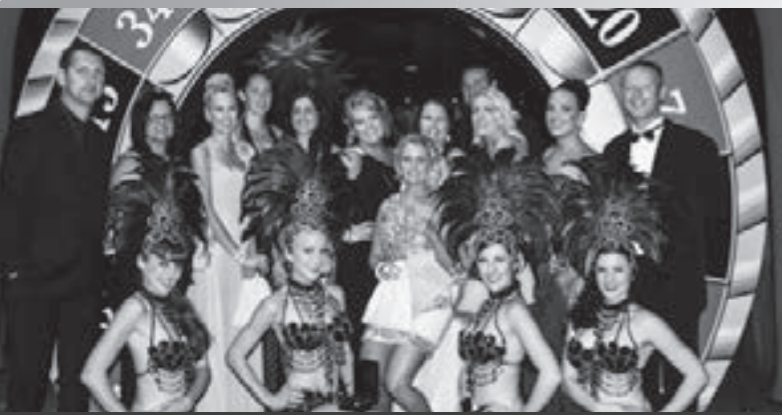
Hastings Deering Social Club committee at the annual Charity Ball which helps to raise much needed funds for The Mackay Foundation.