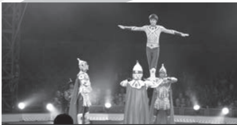
Performers of the Great Moscow Circus wow the audience at the Mayor's Charity Event, with all funds raised going towards The Mackay Foundation.