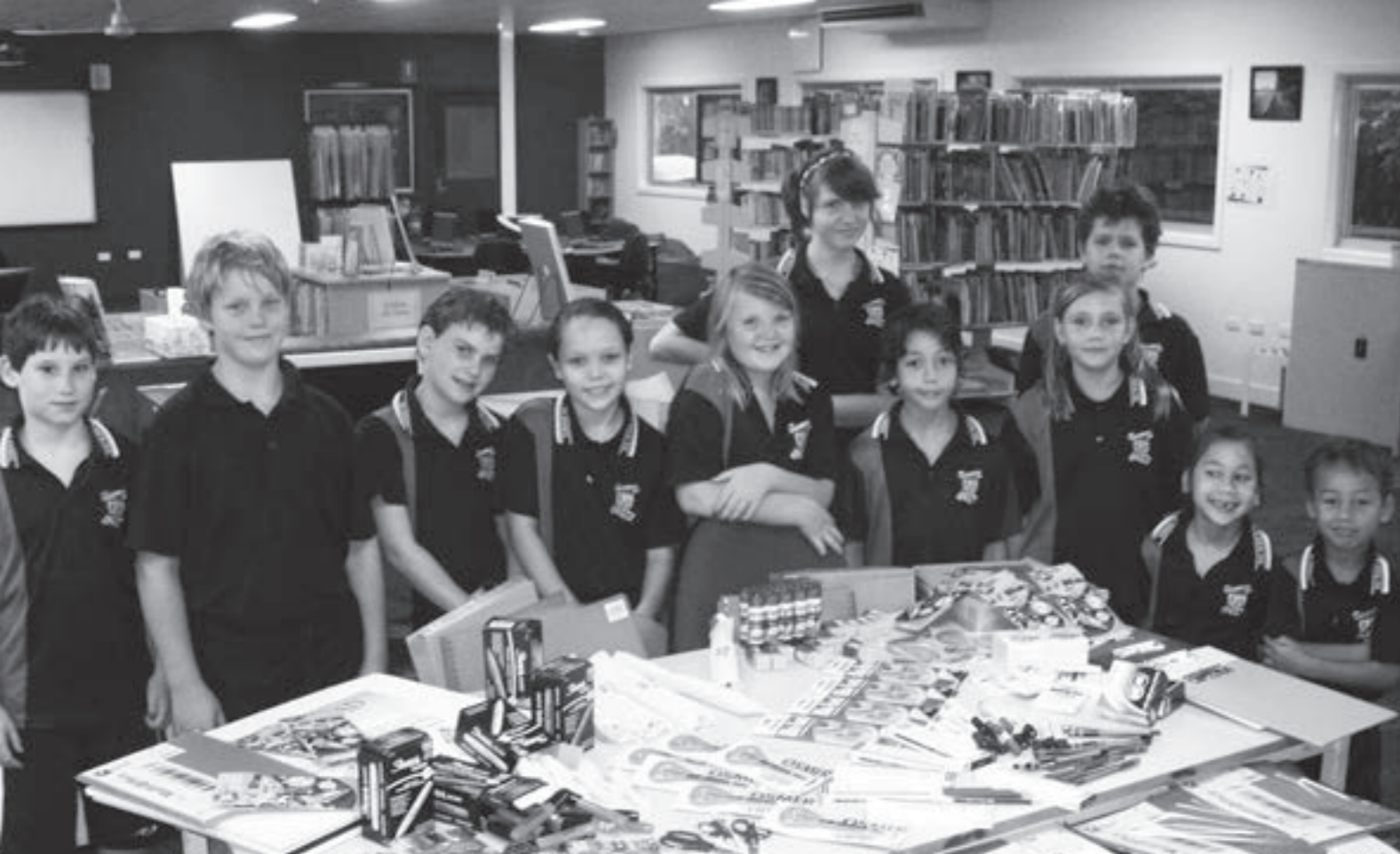
Students from Dundula State School with schools supplies purchased through the Mackay Foundation Back to School Program.

Many families were very happy with the "helping hand" from The Mackay Foundation.