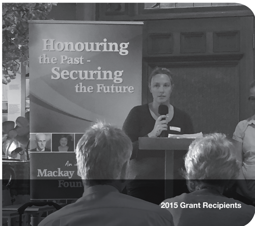
2015 Grant Recipients